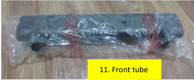
11. Front tube