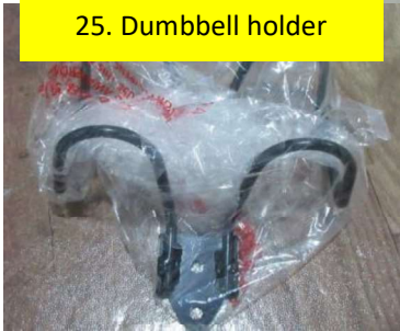
25. Dumbbell holder