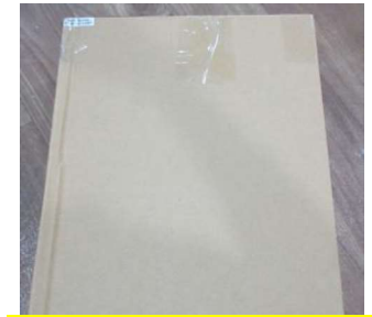
14. Console with tablet holder